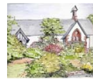
St. Mary's Scottish Episcopal Church In The Trossachs and Strathendrick

01877 382383, or from the Forestry Commission's public enquiries line, 0845 FORESTS (0845 367 3787).